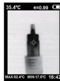
White & black