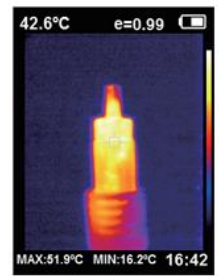
Iron oxide red