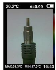
Visible light camera