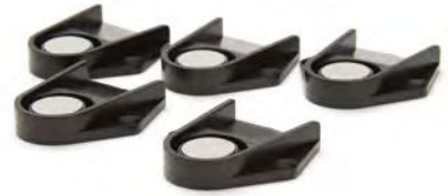
HI920005 Tag holders with tags (5)