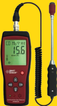
Combustible Gas Detector AR8800B 0~50% LEL