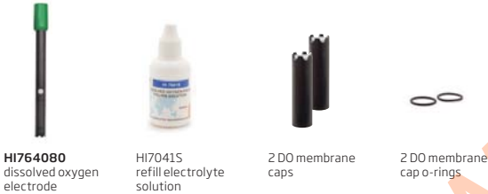
HI764080 dissolved oxygen electrode

edge® DO kit: HI2040-01 (115V) and HI2040-02 (230V) also includes: