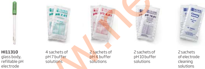
HI11310 glass body, refillable pH electrode

edge® pH kit: HI2020-01 (115V) and HI2020-02 (230V) also includes: