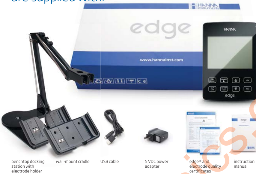
benchtop docking station with electrode holder wall-mount cradle USB cable 5 VDC power adapter edge® and electrode quality certificates instruction manual

All edge® single parameter meters are supplied with: