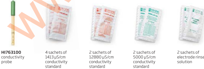
HI763100 conductivity probe

edge® EC kit: HI2030-01 (115V) and HI2030-02 (230V) also includes: