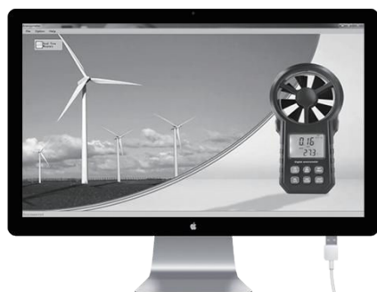
USB communication function