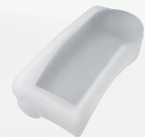
▲ PAL Silicone Cover

◀ Small Volume Sample Adapter for PAL Allows for measurements with a small volume of sample. Place directly on the sample stage.