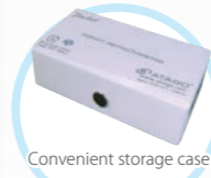
Convenient storage case