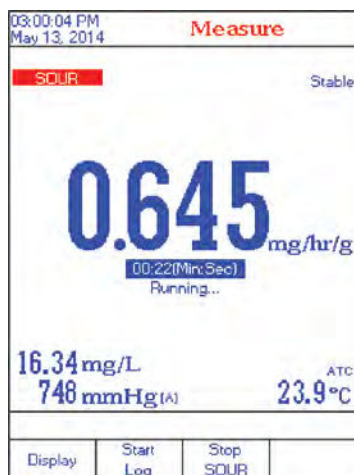
SOUR (Specific Oxygen Uptake Rate)