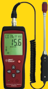
Combustible Gas Detector AS8800A 0~50% LEL