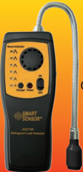
Refrigerant Gas Detector AS5750