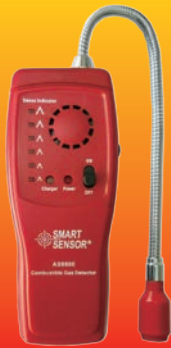
Combustible Gas Detector AS8800