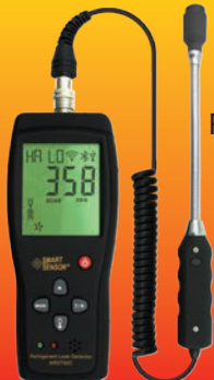
Refrigerant Gas Detector AR5750C 0~1000PPM