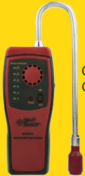
Combustible Gas Detector AS8800L