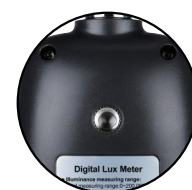
Back screw female design