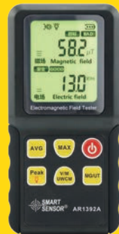
EMF-Tester AS1392A 30Hz ~ 300Hz