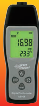
Tachometer AS926 2.5~99999RPM