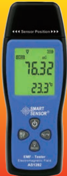
EMF-Tester AS1392 30Hz ~ 300Hz