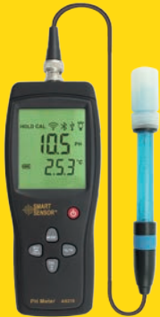
PH Meter AS218 0.00~14.00pH